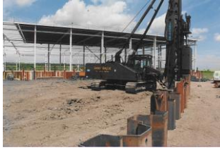
Image of Green Piling's first rig completing our first ever project