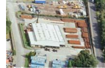
Aerial view of our Renishaw offices