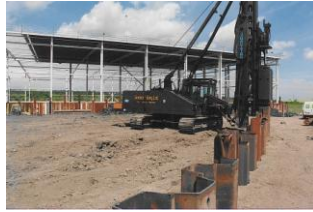
Image of Green Piling's first rig completing our first ever project